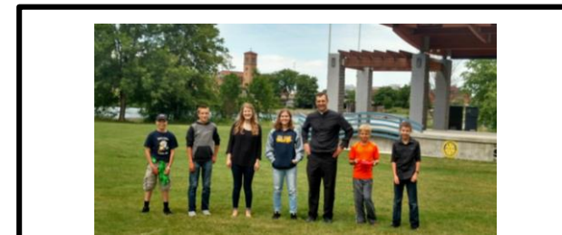
Faith & Fun in the Sun

Our "Faith & Fun in the Sun" goers had a not so sunny start to their day for their 1 st outing on Thursday, but still had a great day! The younger kids have their day scheduled for June 27 th . More dates will be added for July and August for both groups.